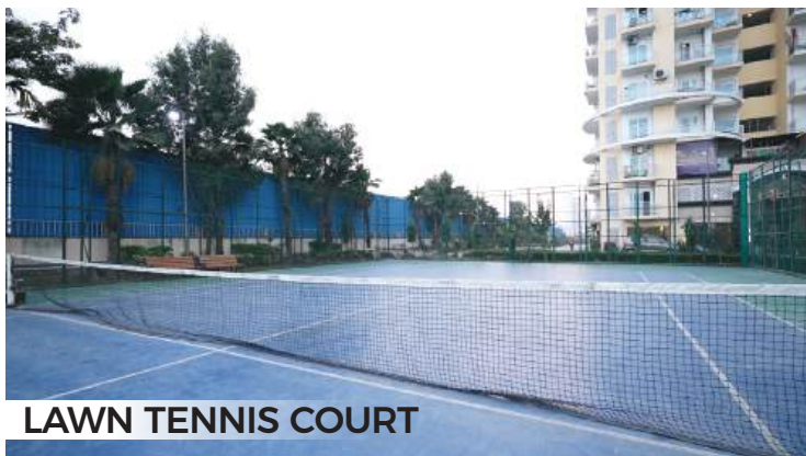
LAWN TENNIS COURT