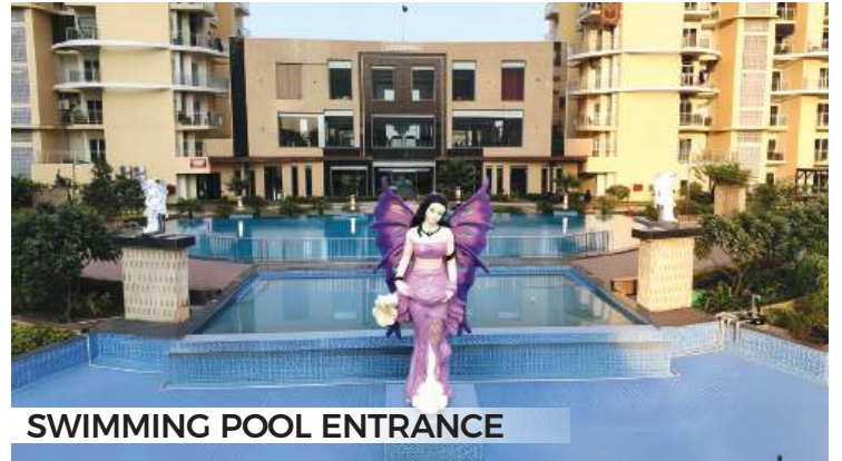
SWIMMING POOL ENTRANCE